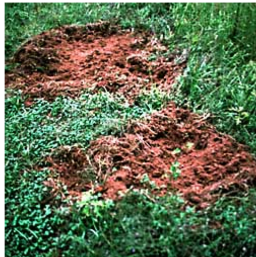
Figure 3. Picture demonstrating food plot damage caused by feral hogs.

will also eat tremendous amounts of any supplemental feed that is available. When the food source is gone they have a nasty appetite for distruction and often do a great deal of damage to feeders.