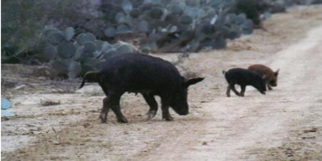
Figure 2. Picture of a young sow and pigs taken from wildlifemanagementpro.com

of what is today the southeastern United States.