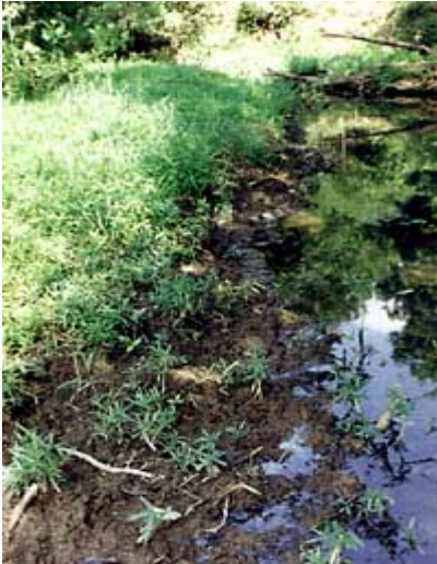
Figure 4. This picture demonstrates damage caused by feral hogs to water quality and native plants.

through February 1 st of 2008 and will cost $100.00 per campsite. This price will cover one camper or tent used on Rayonier property. However, campers will need to be mobile so that they can quickly and easily be moved on short notice. Interested clubs should contact Jeremy Tankersley at (334) 427-9676 ex. 26 .